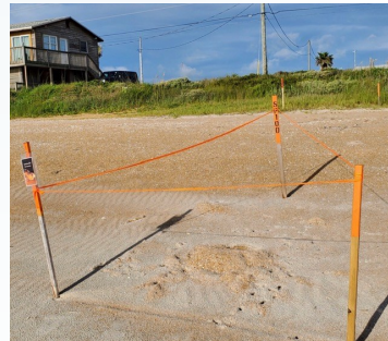
Adopted Turtle Nest